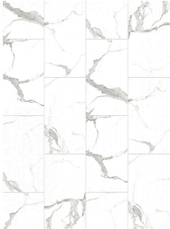
4 Colors Pg3